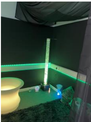
‘The Nurture Room’

All procedures as set out in the SEN Code of Practice 2014 are followed.